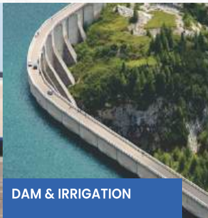
DAM & IRRIGATION