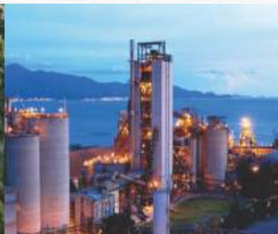
OIL & GAS PLANT